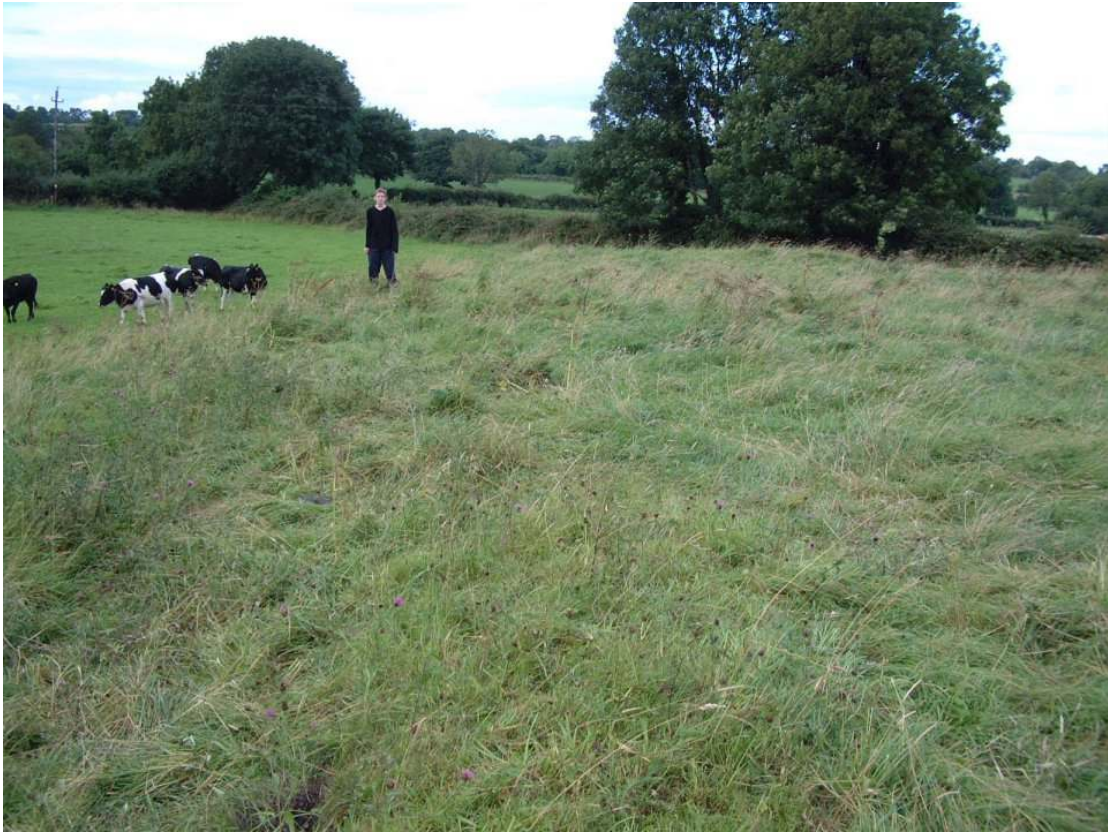
Site from another angle