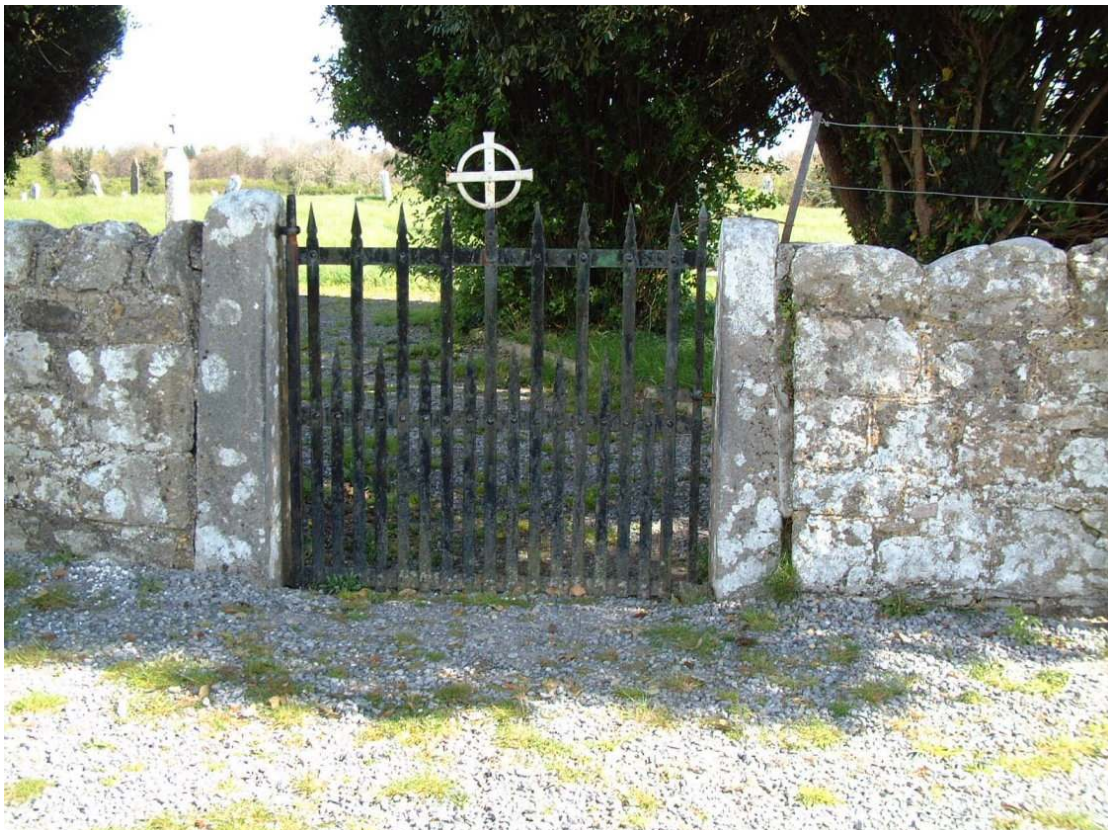
Entrance at Cemetery