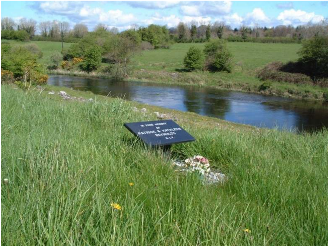
View from another angle