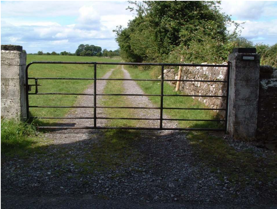
Entrance at Public Road