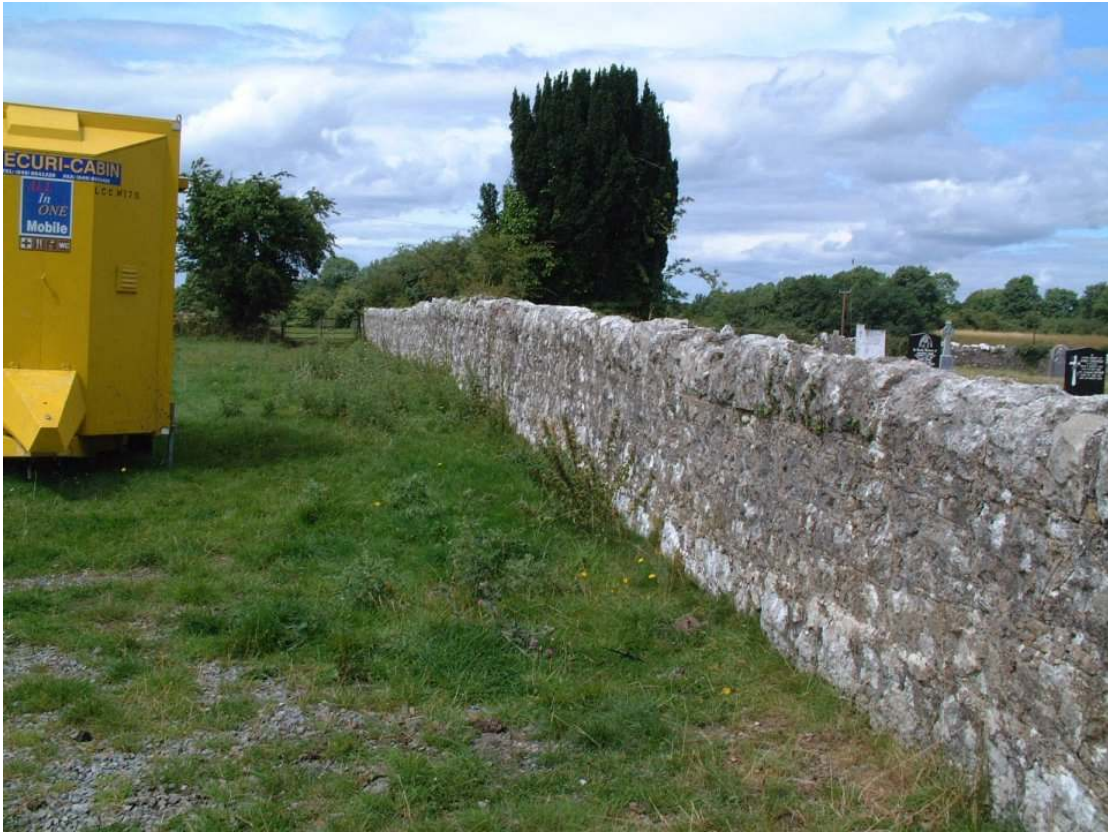
Part of Boundary