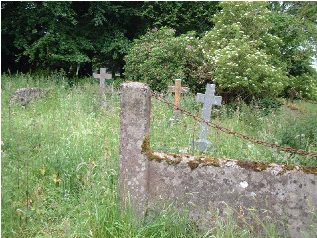
Burial Enclosure of Bond Family