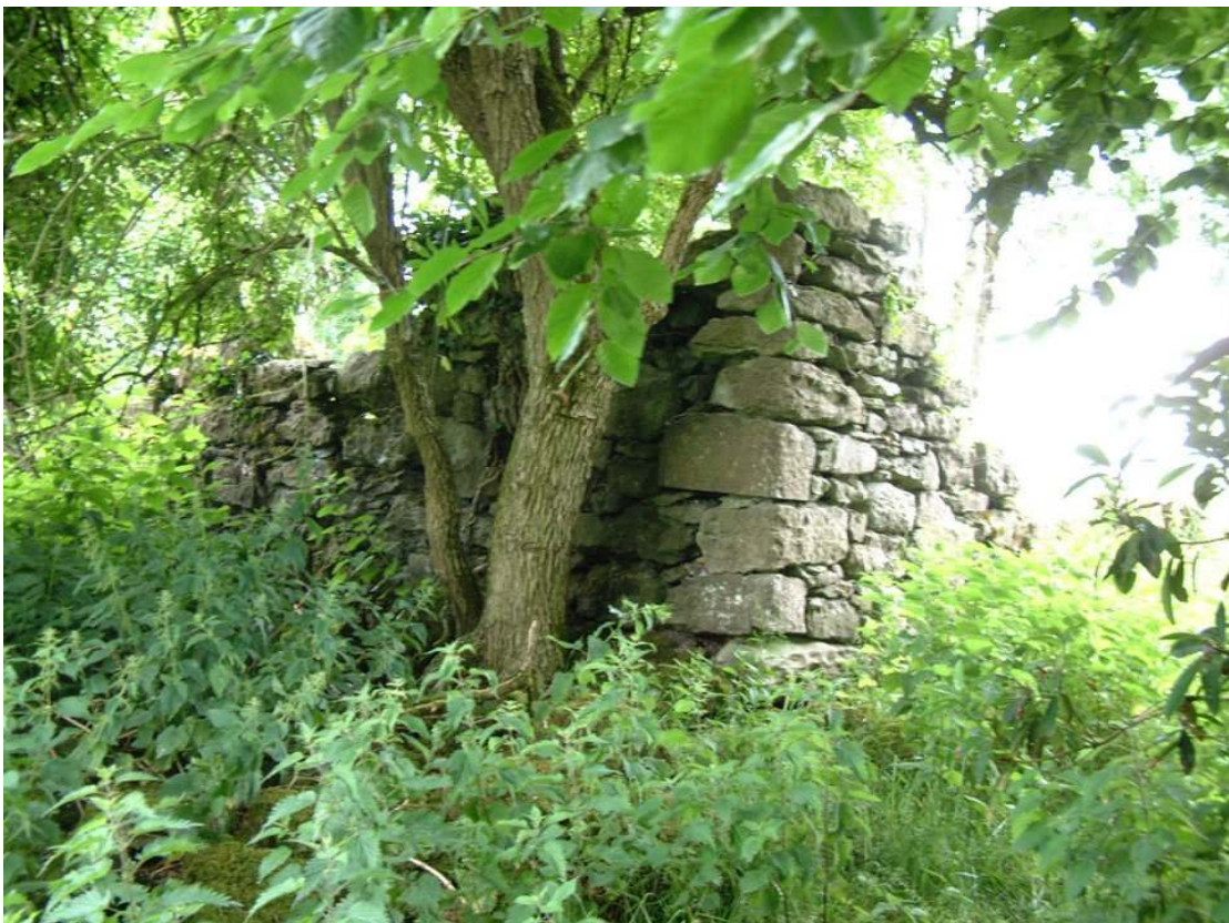
Ruins of Church