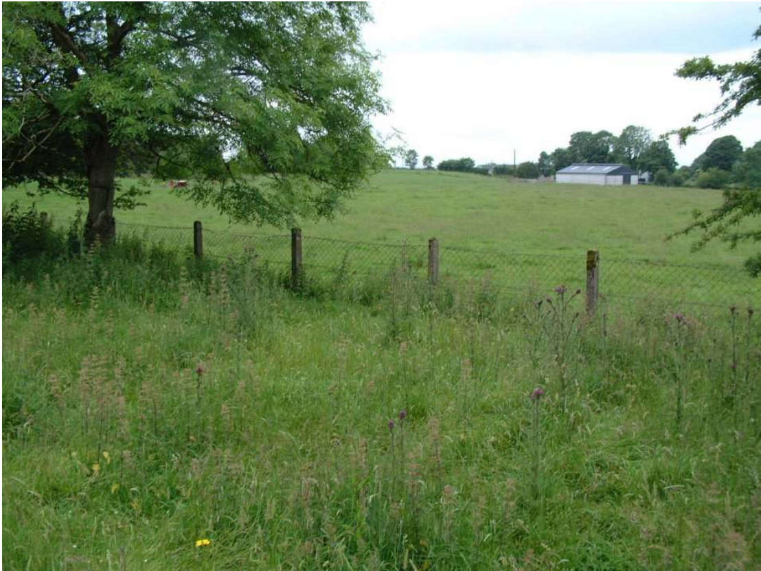
Section of Boundary.