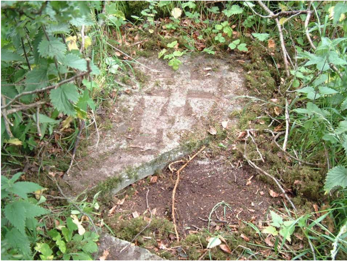
Old Memorial {1642}