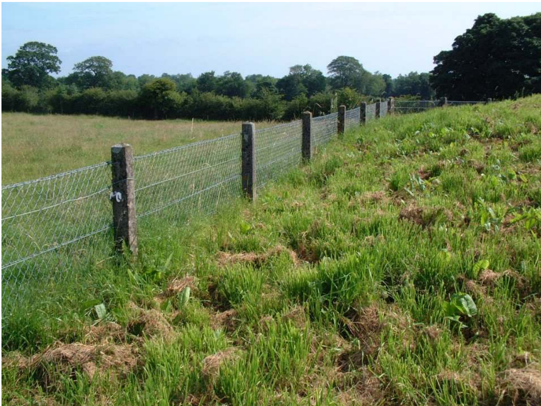
Part of Boundary