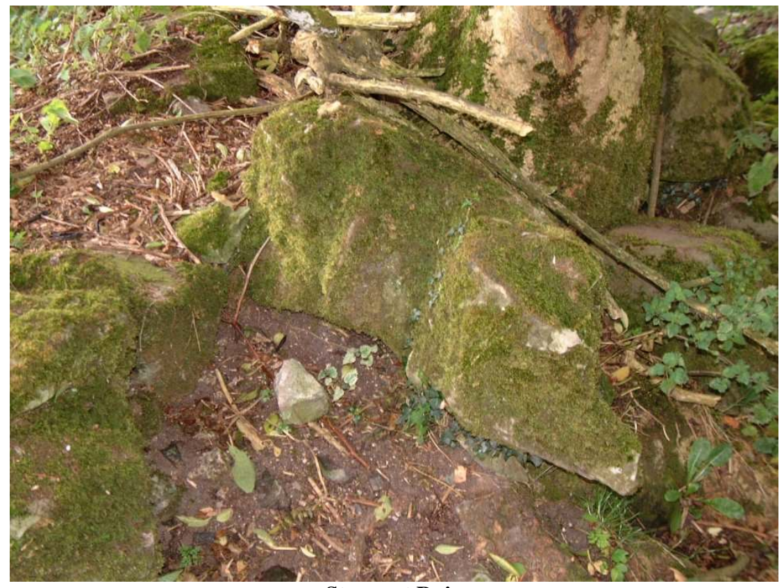
Stones at Ruin