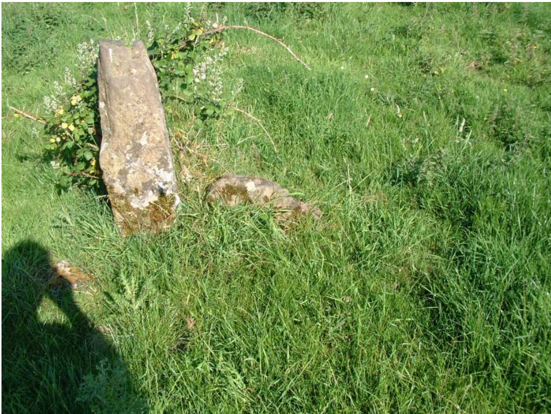
What appears to un-inscribed grave markers?