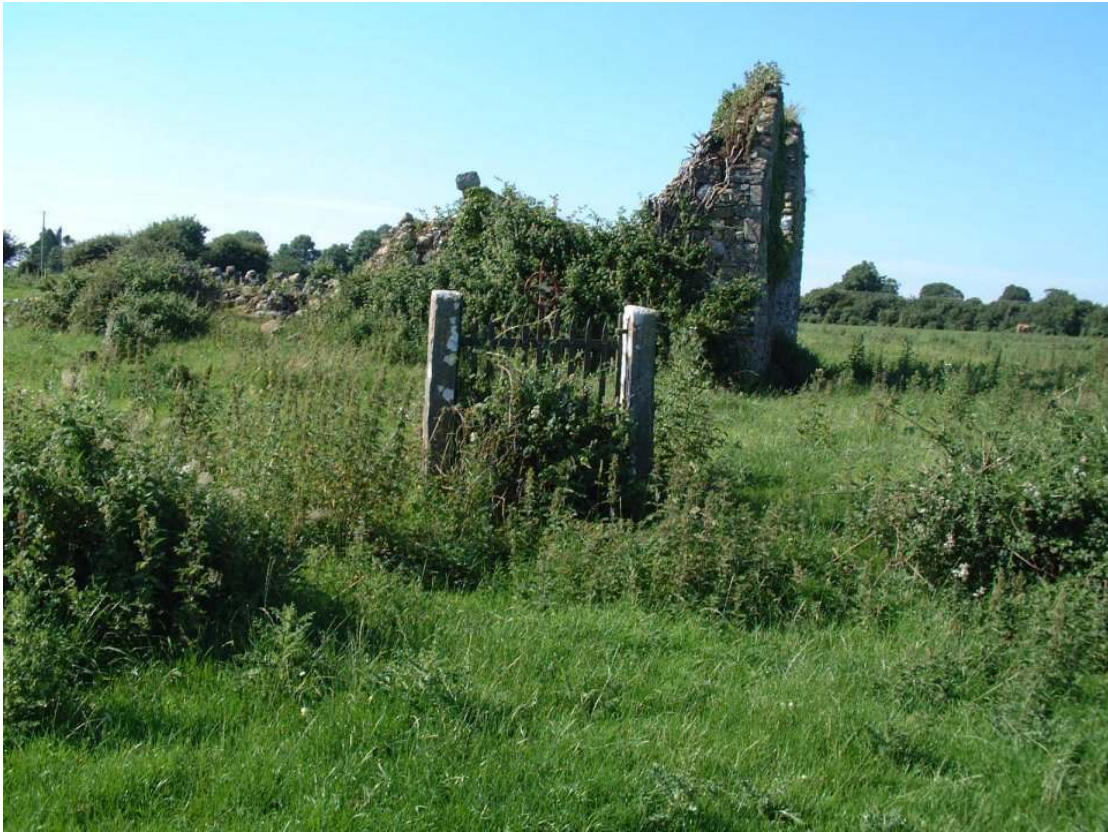
Pillars & gate