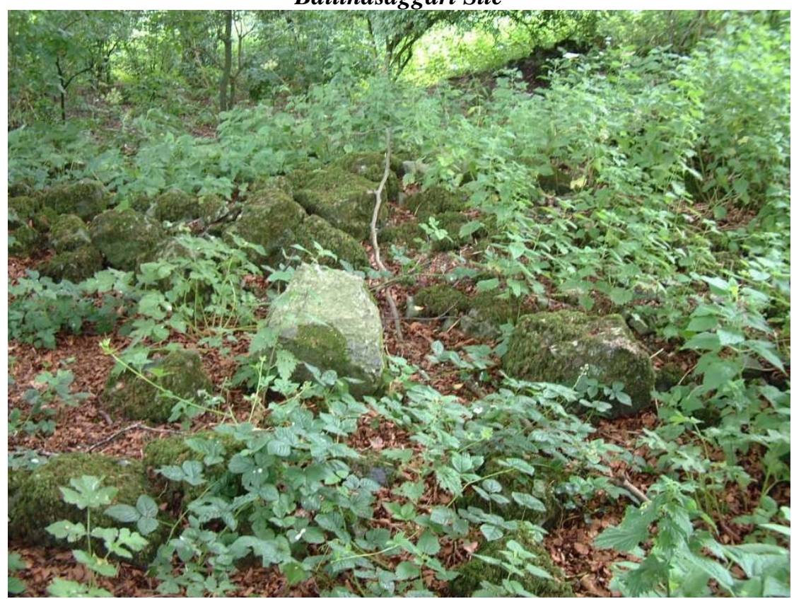
What appears to be a ruin?