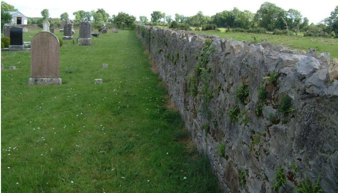
Part of Boundary