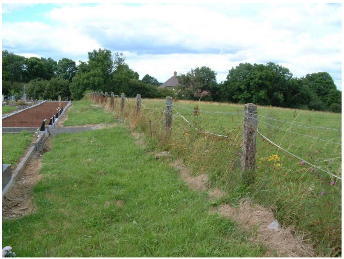
Part of Boundary