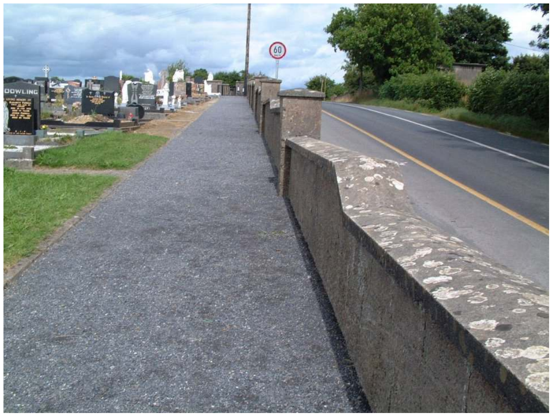
Part of Boundary