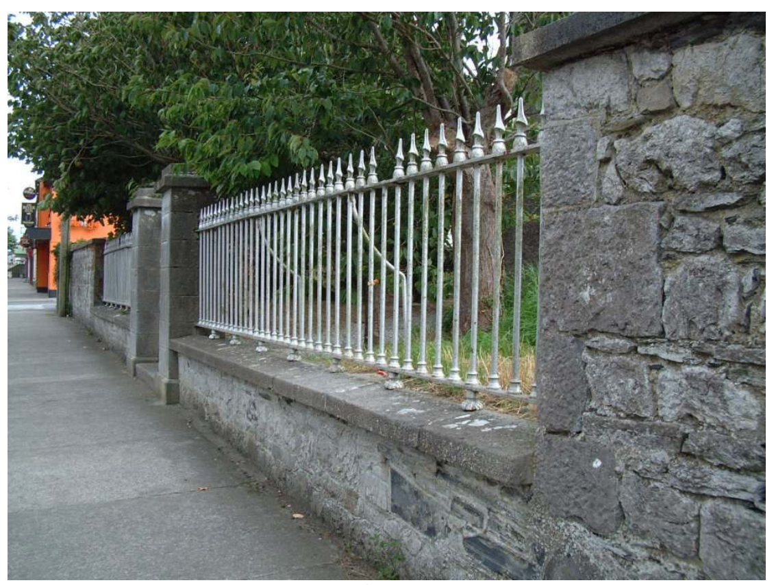
Part of Boundary