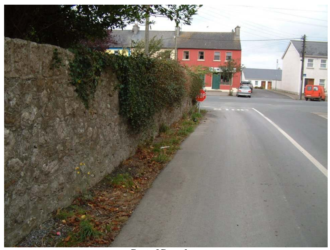
Part of Boundary