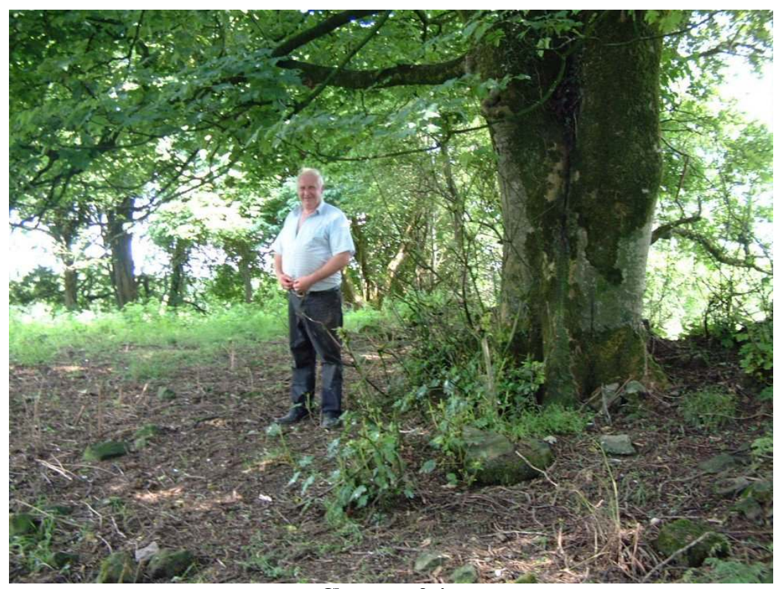
Close up of site