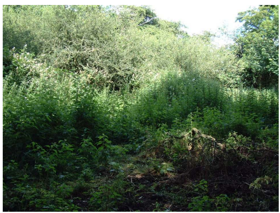
Site from another angle