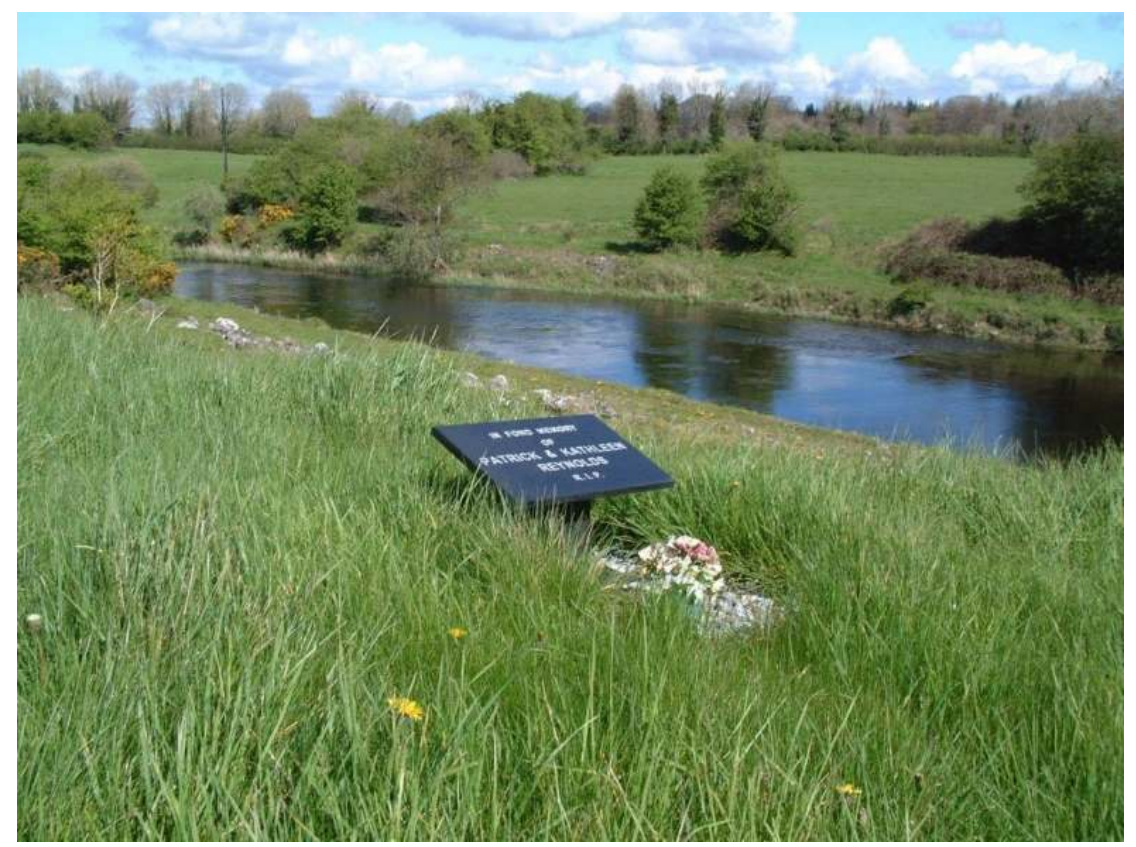
View from another angle