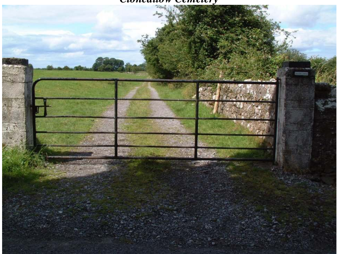
Entrance at Public Road