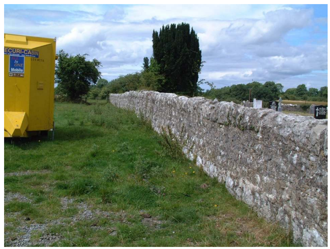
Part of Boundary