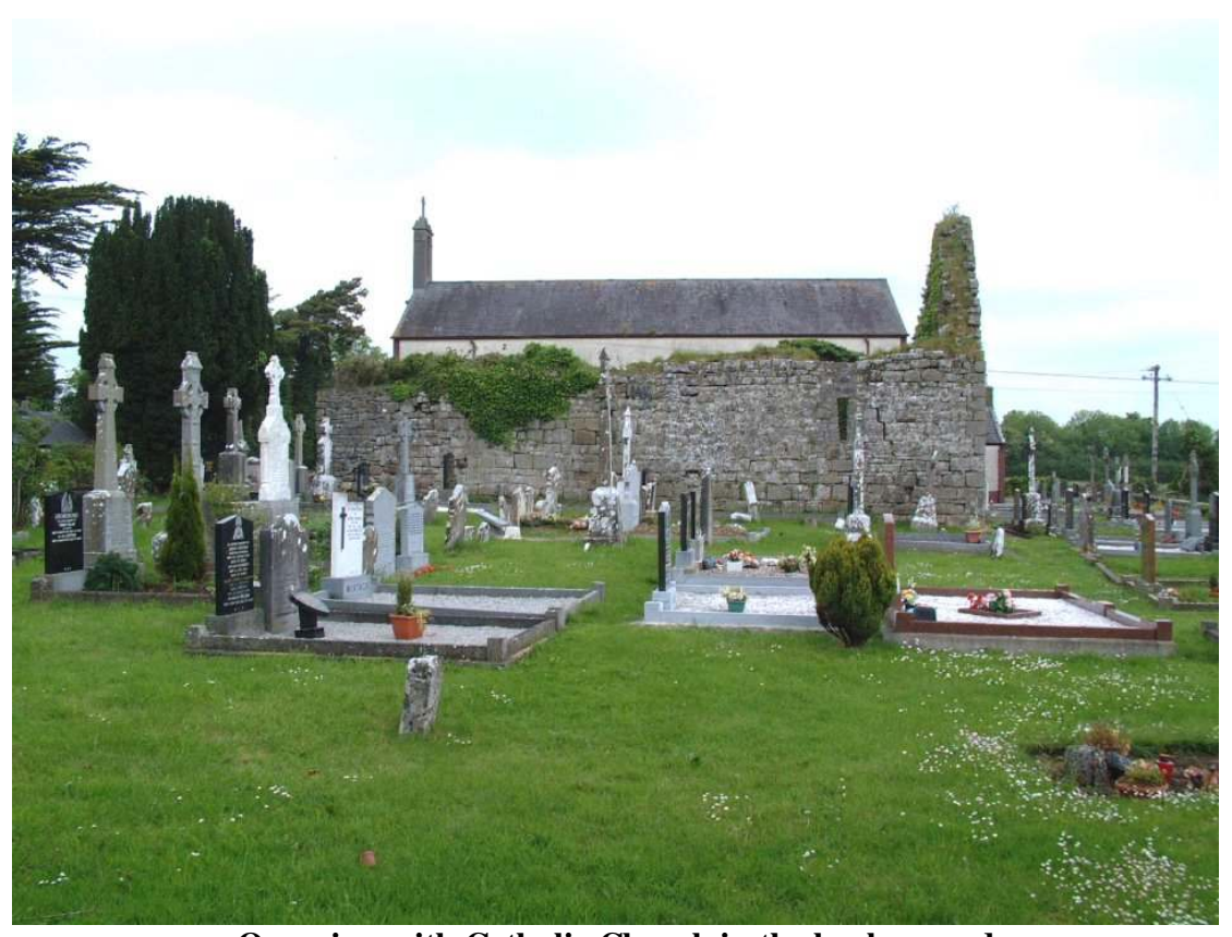
Overview with Catholic Church in the background