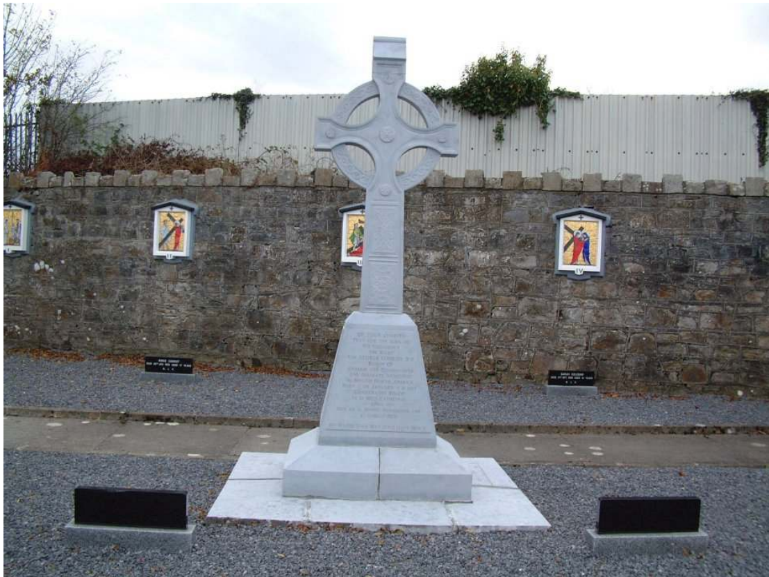
Bishop Conroy's Grave