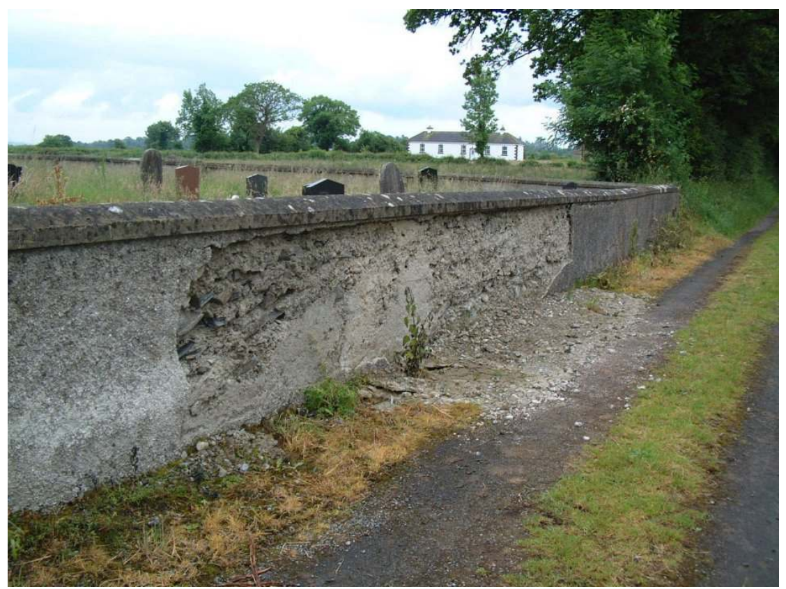
Section of Boundary Wall