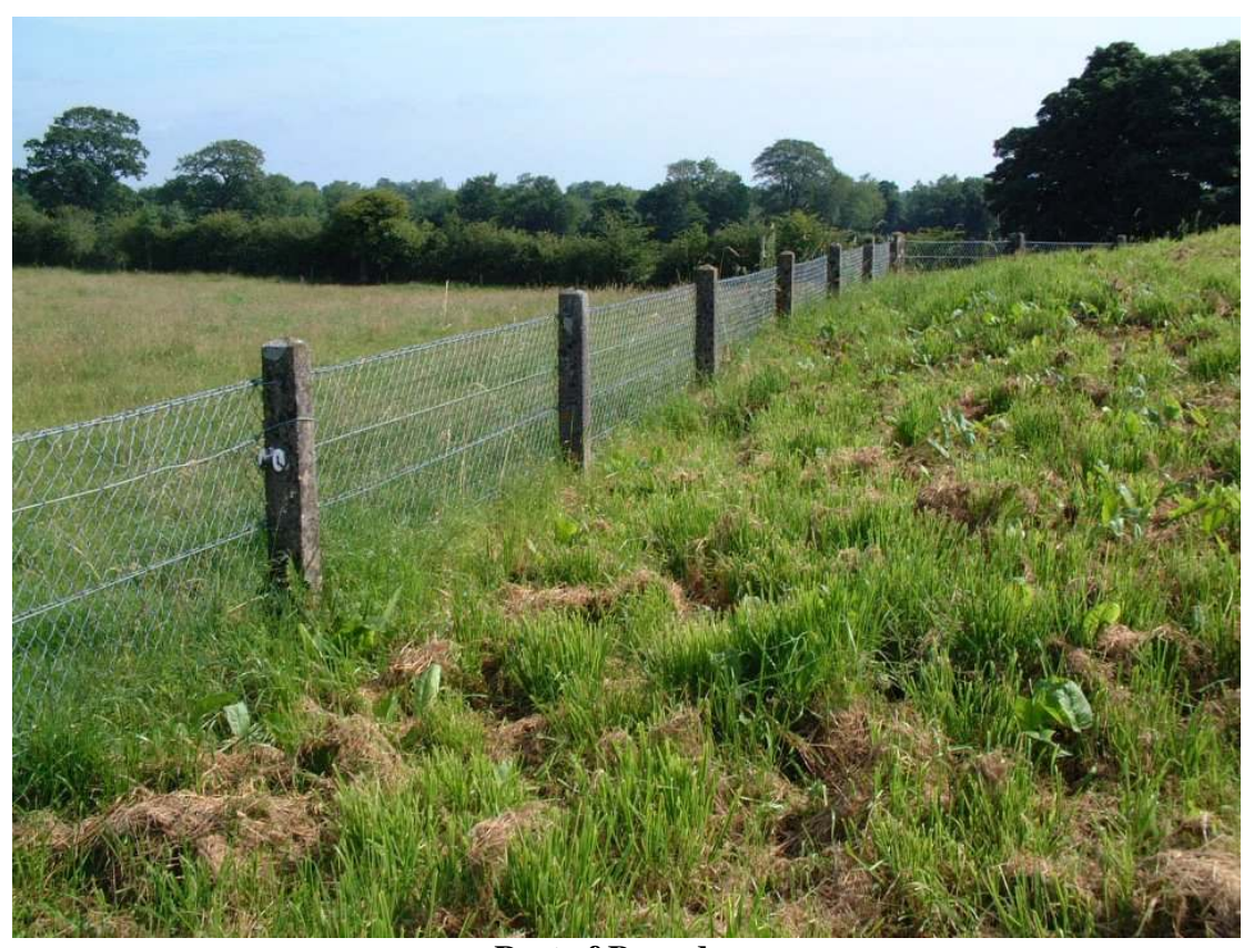
Part of Boundary