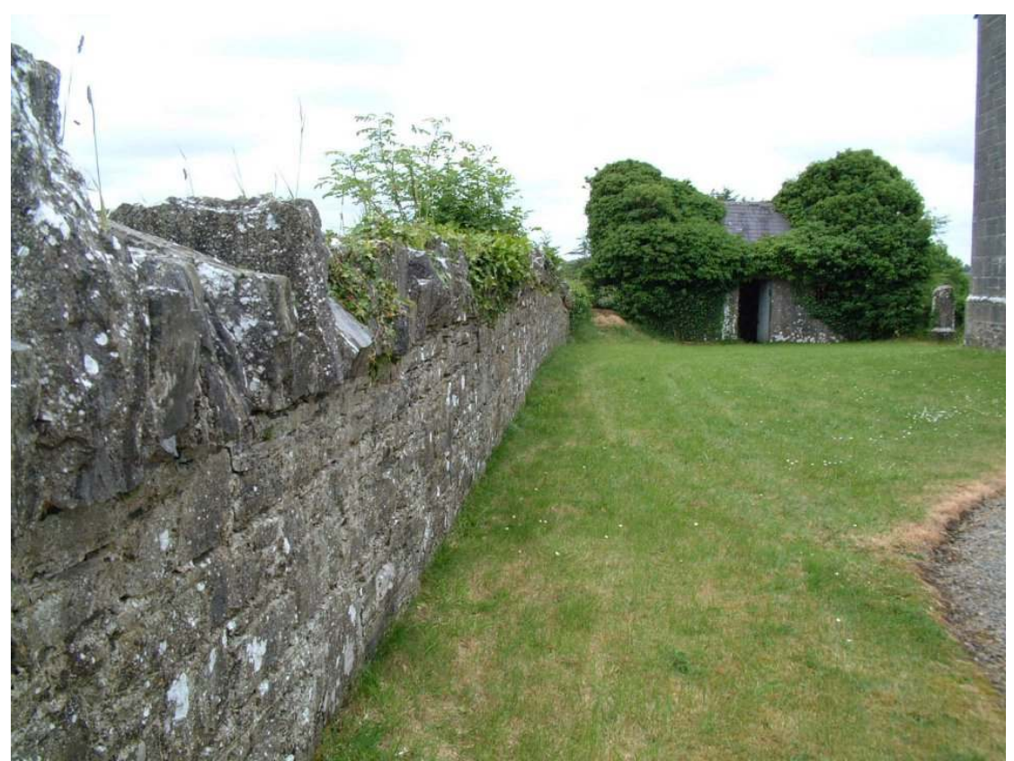
Section of Boundary Wall