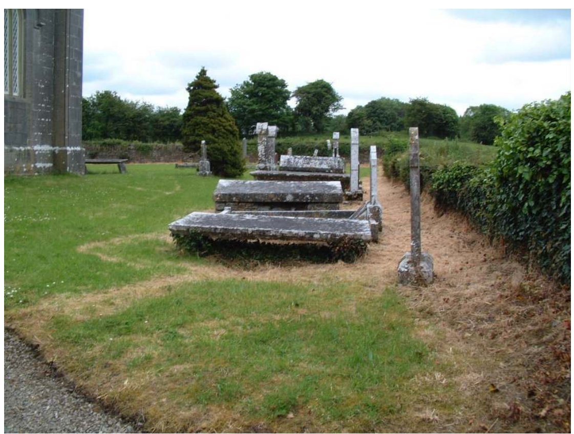
Overview of a section of cemetery