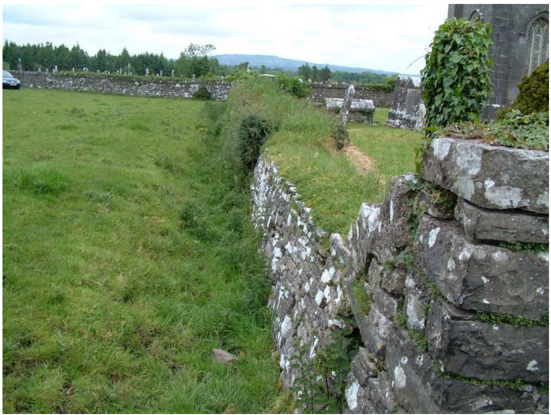
'Ha-Ha' Style Fence