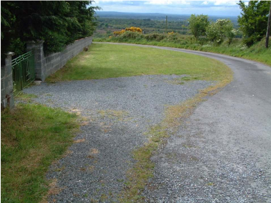
Area utilised for parking.