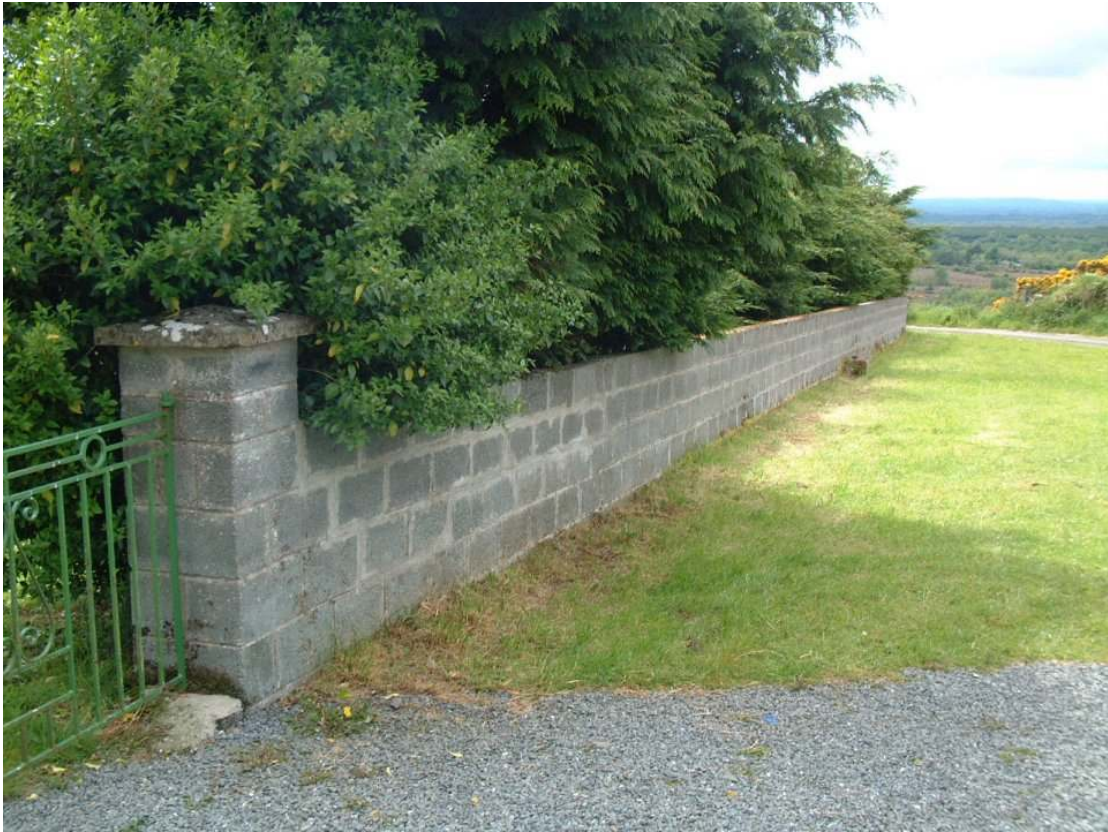
Section of Boundary Wall