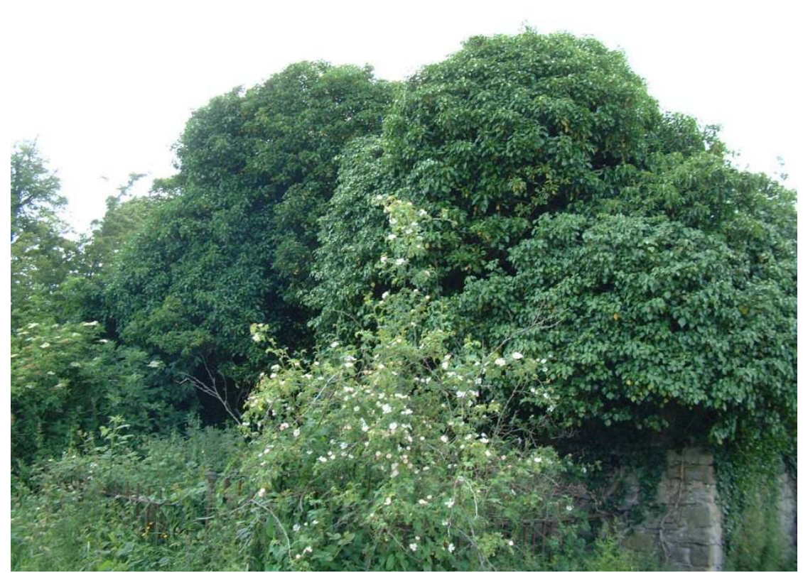
Burial Enclosure Rail in Foreground