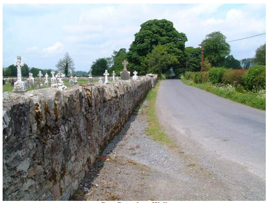
Part Boundary Wall