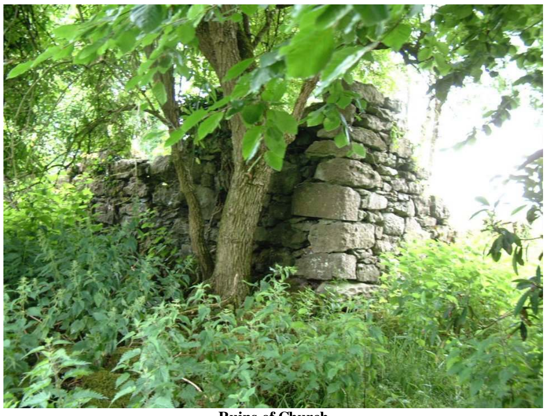
Ruins of Church