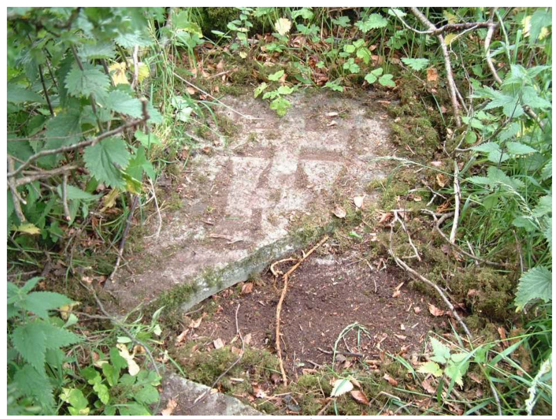
Old Memorial {1642}