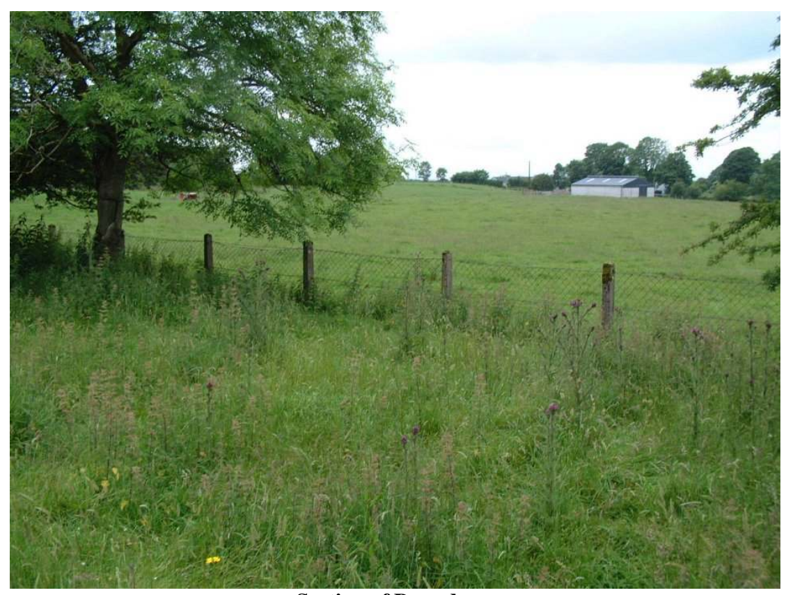
Section of Boundary.