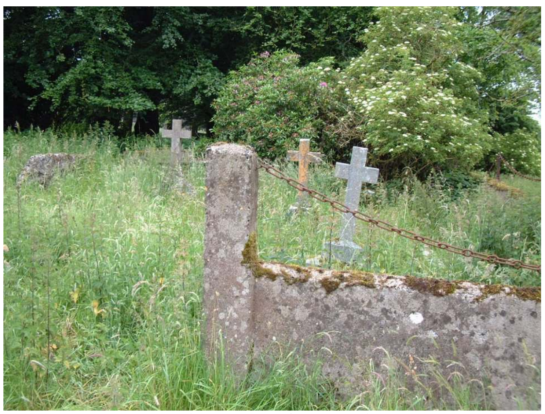
Burial Enclosure of Bond Family