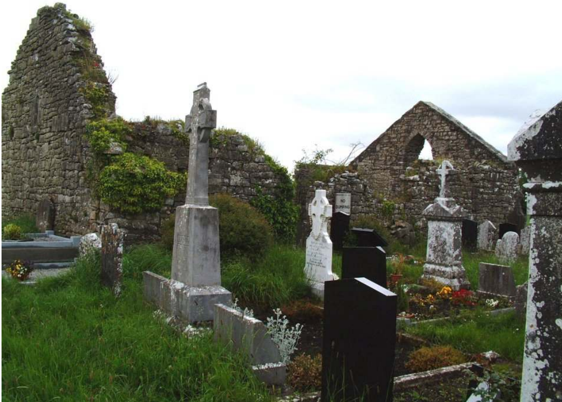
Ruins of Church