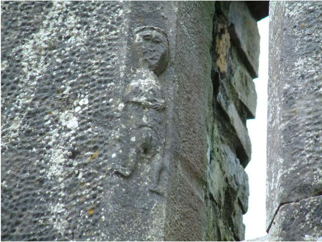
Sheela - na - Gig.