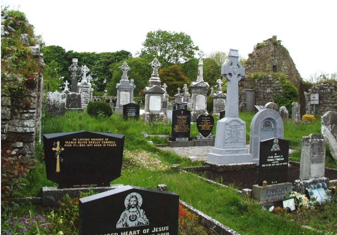
Overview of section of Cemetery