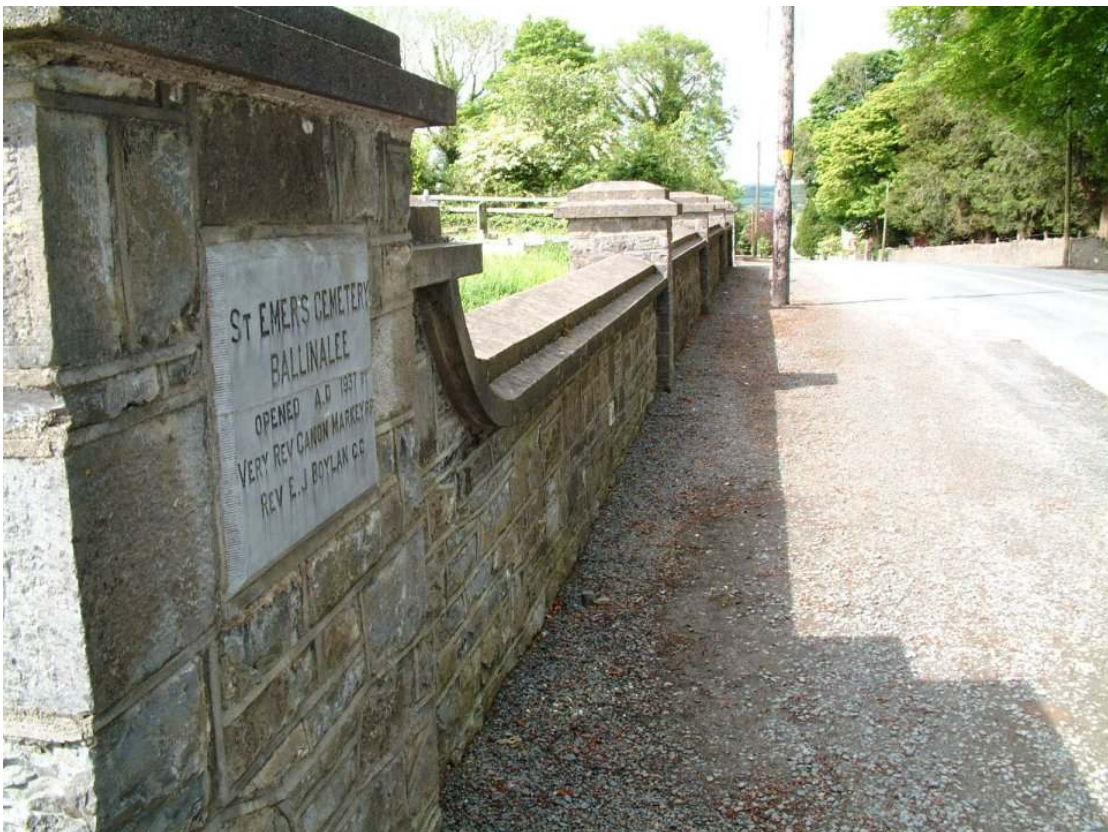
Section of Boundary Wall