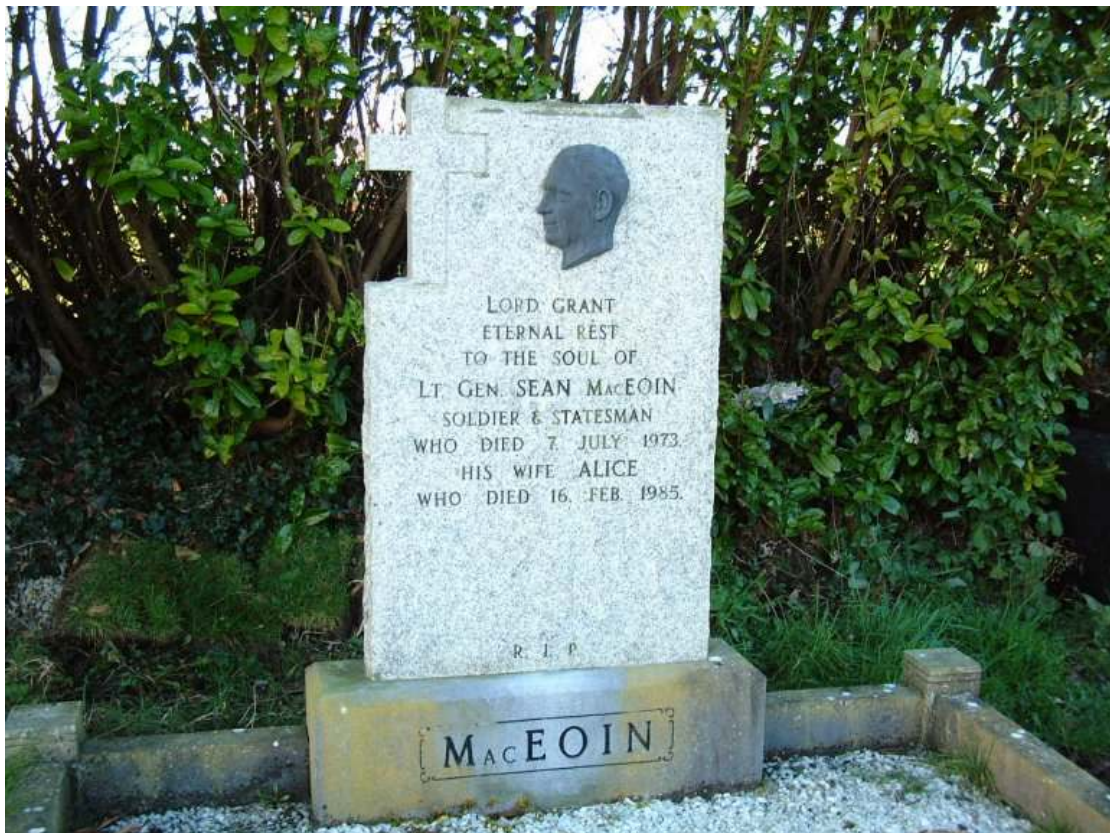
Grave of Lt. General Sean MacEoin