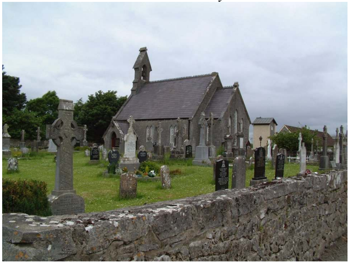
Church of Ireland & Cemetery