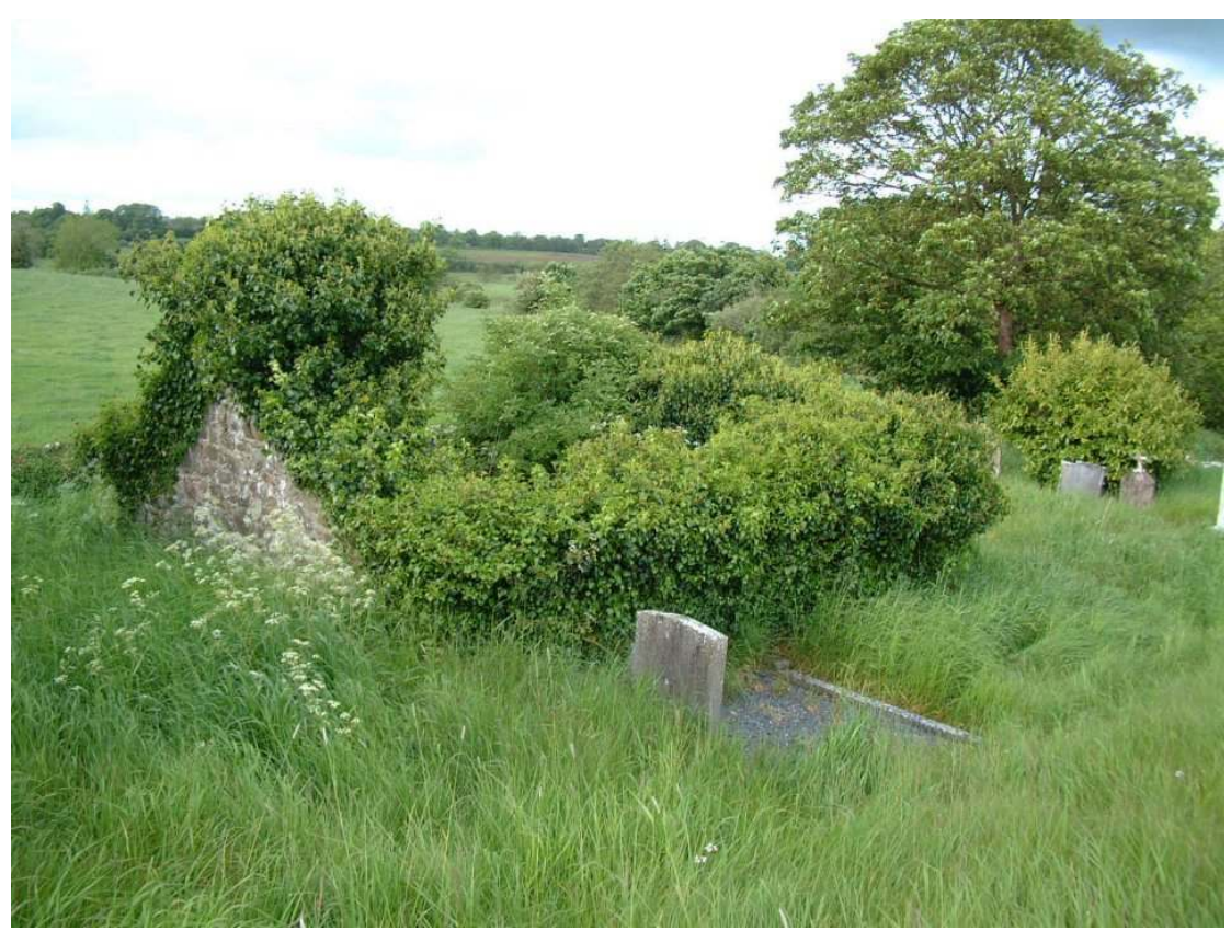
Burial Enclosure (Evers) and perhaps remains of old Ecclesiastical Building