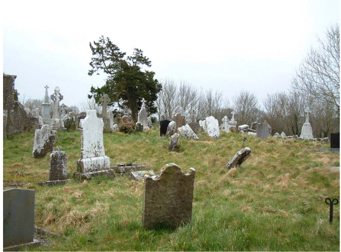
Overview of part of Cemetery