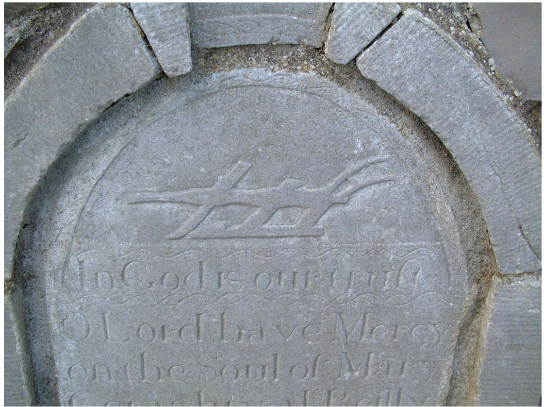
Ploughman's Grave memorial