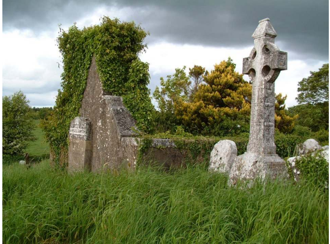
Burial Enclosure (Dowdall) and perhaps remains of old Ecclesiastical Building