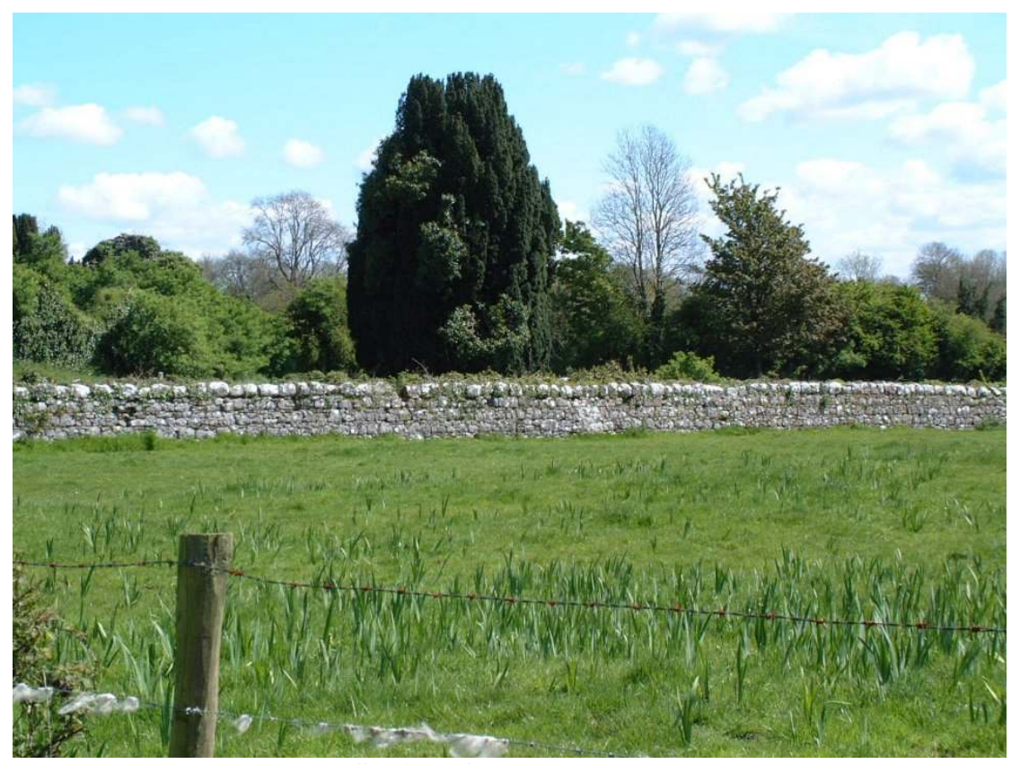
Section of Boundary Wall