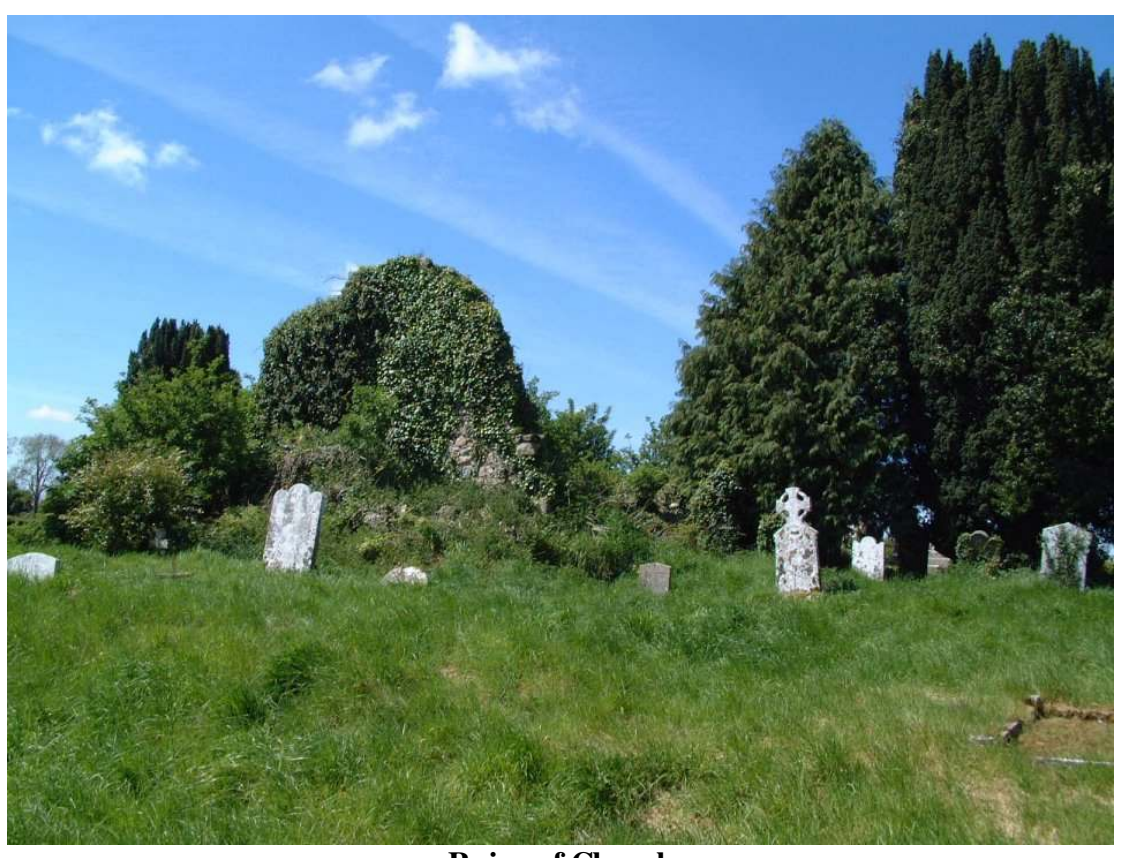
Ruins of Church