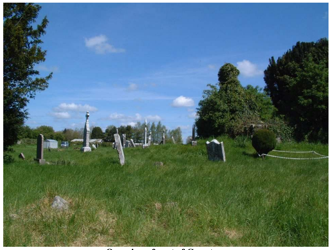
Overview of part of Cemetery