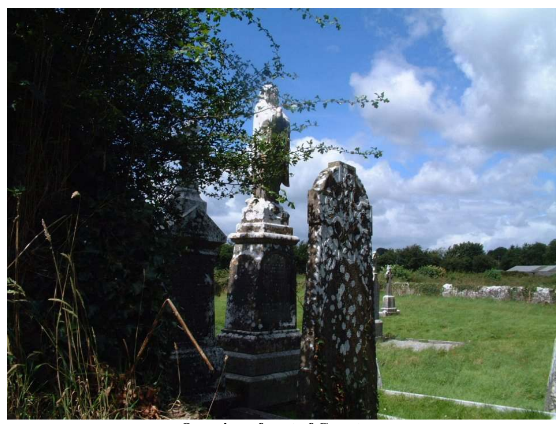
Overview of part of Cemetery