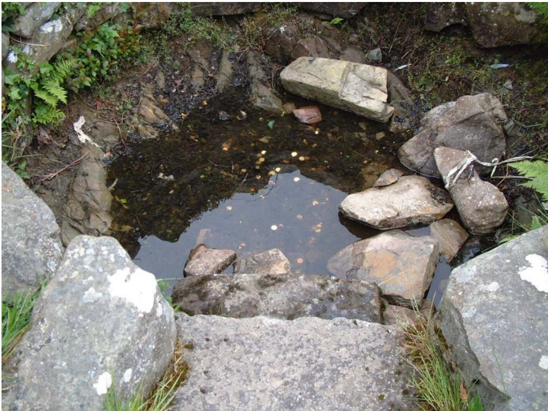
'Close-up' of Well