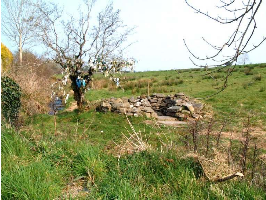
Saint Patrick's Well