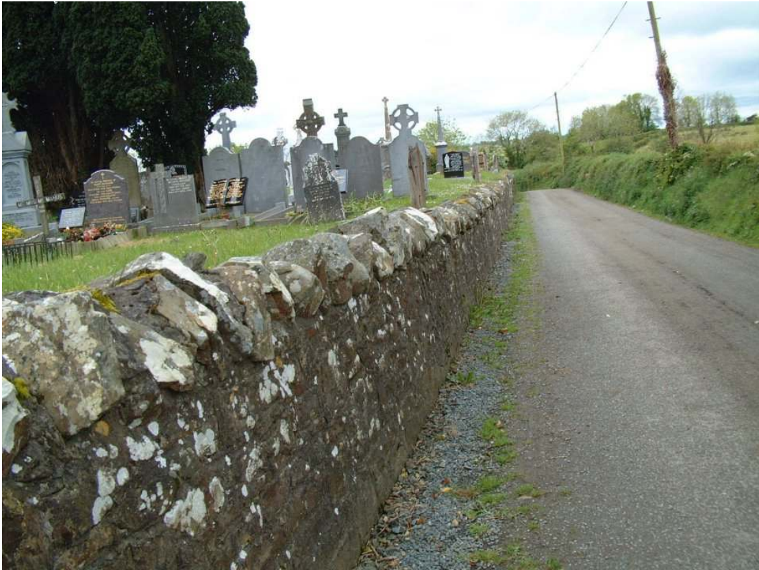
Section of Boundary Wall.