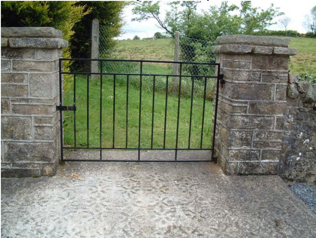
One of the Entrance Gates