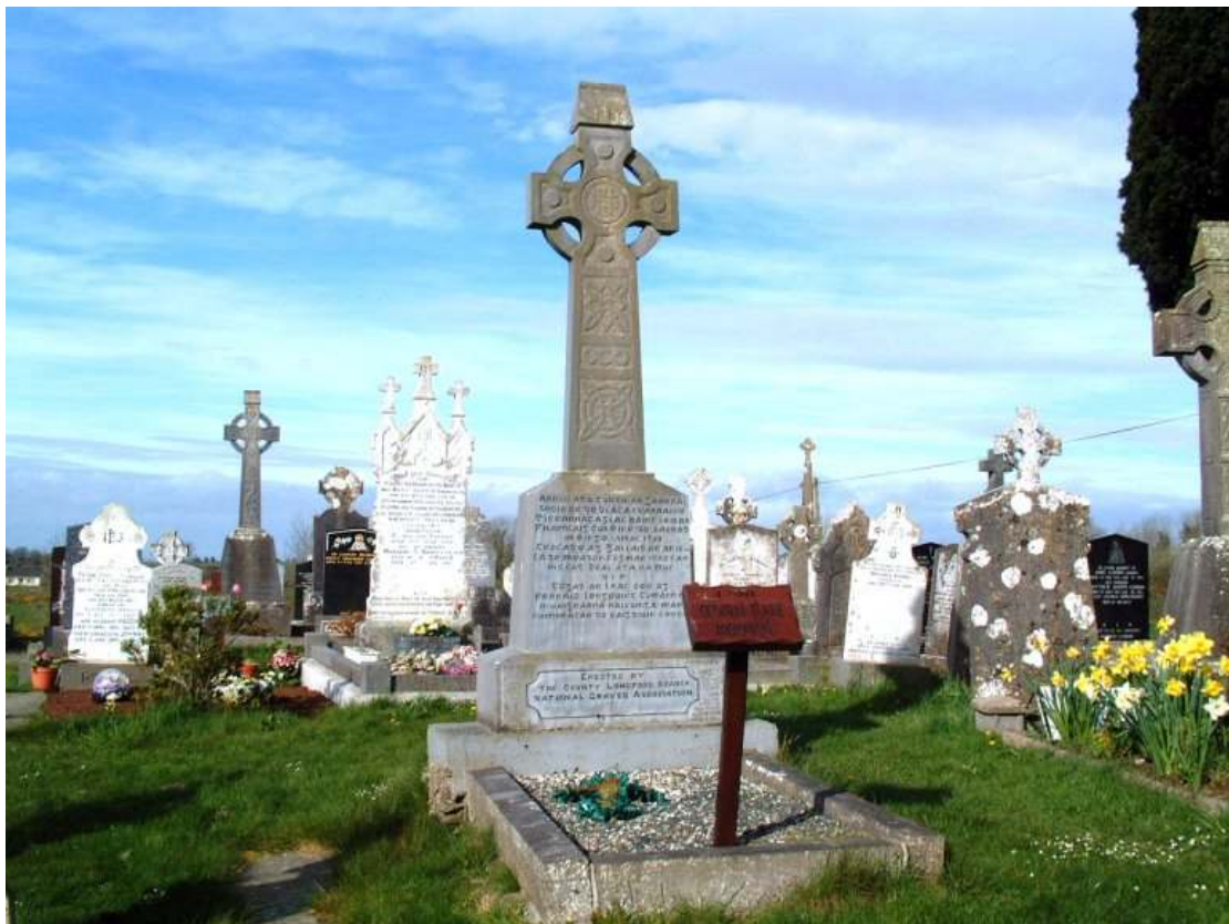
General Blake's Grave