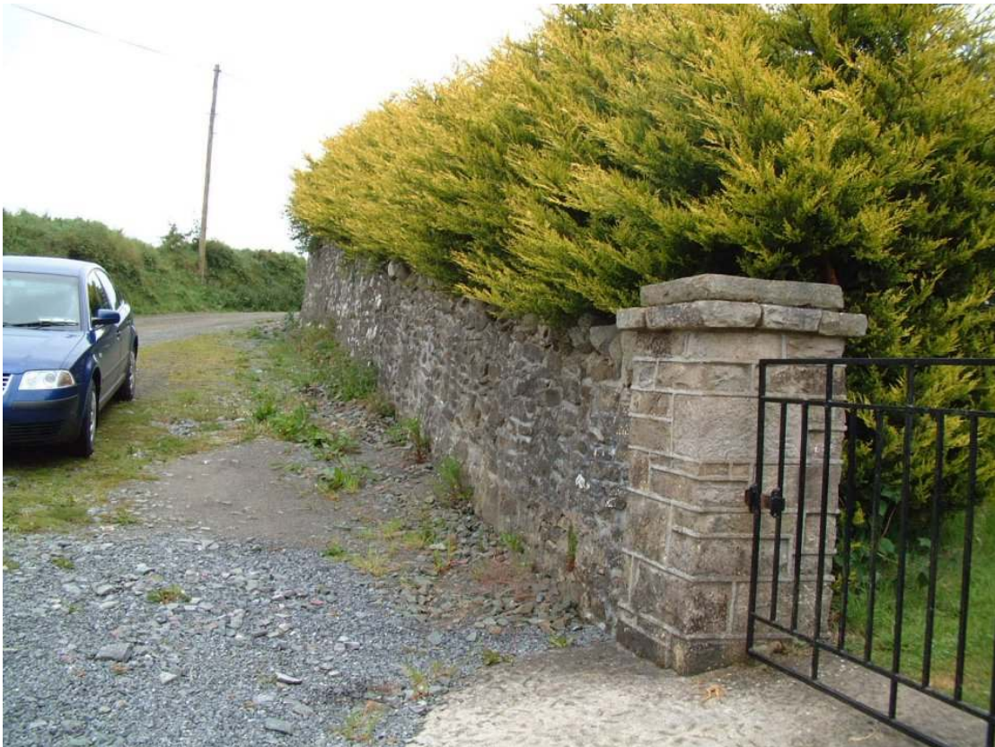
Another Section of Boundary Wall