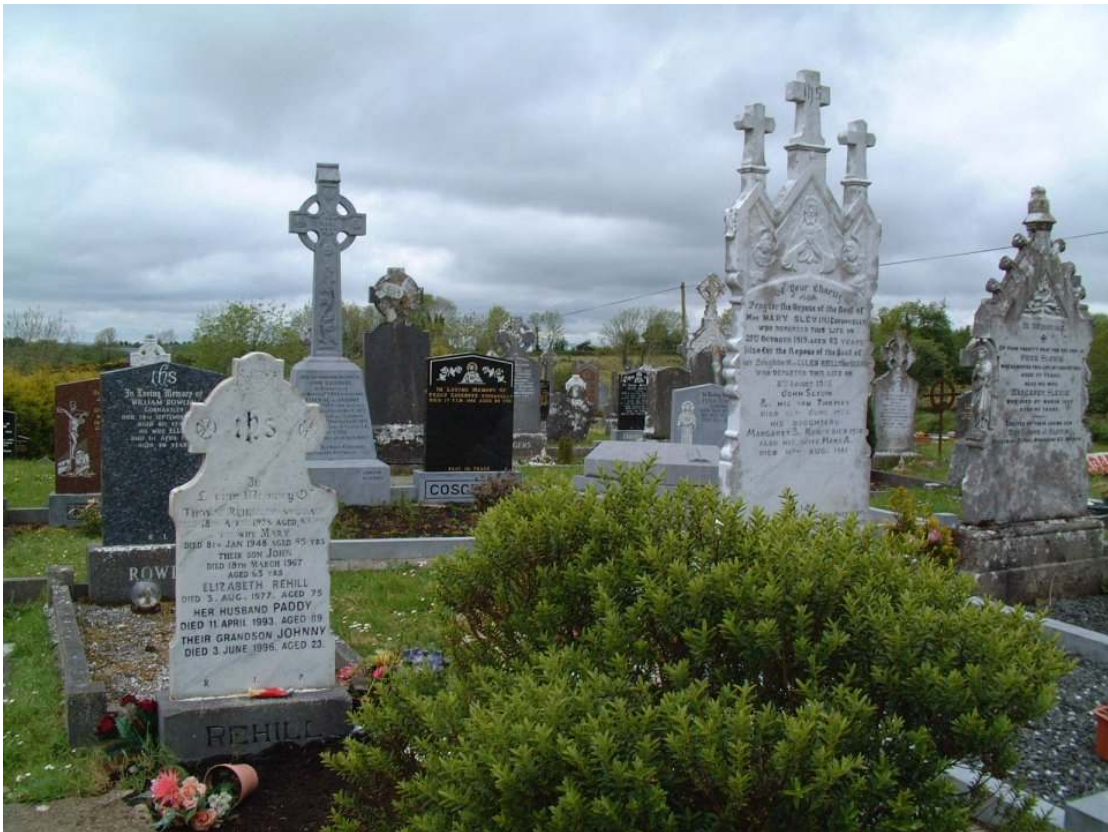
Overview of a section of the Cemetery