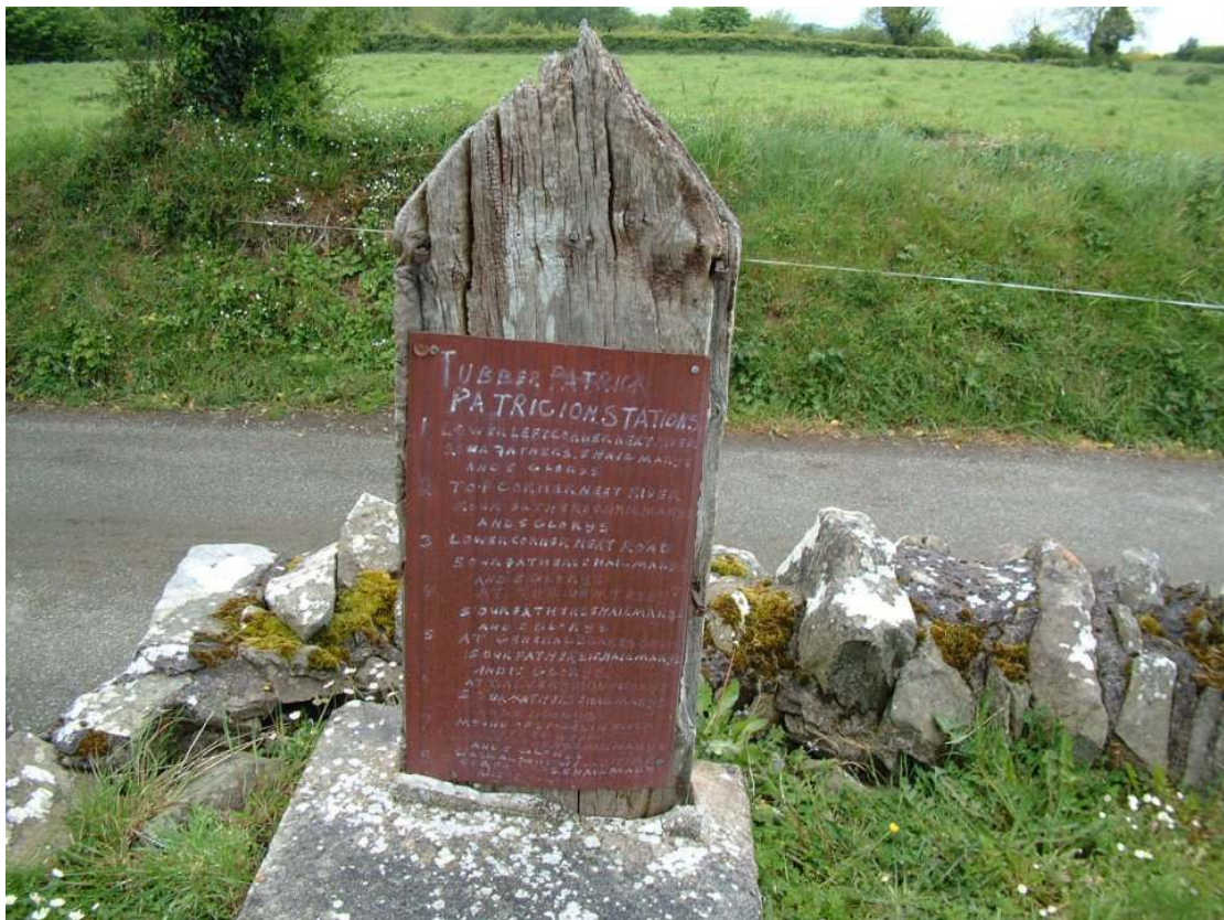
Stations of the Cross