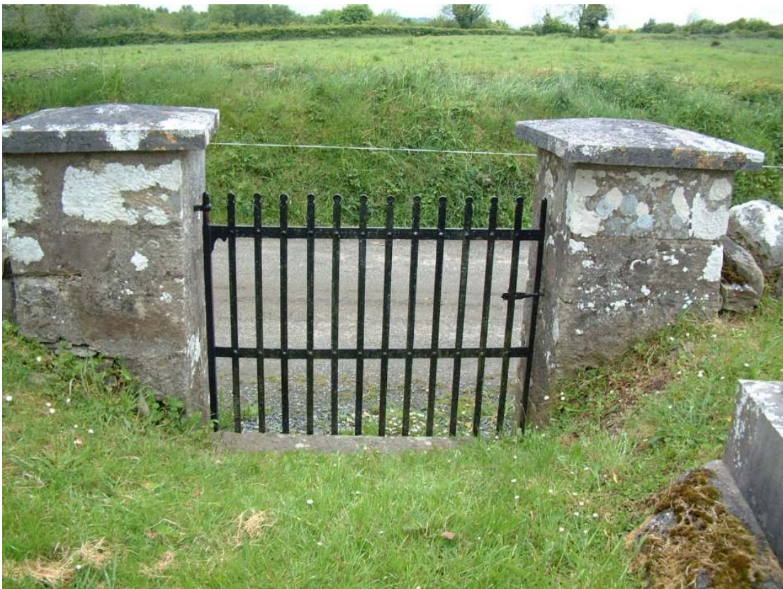
Another Entrance Gate