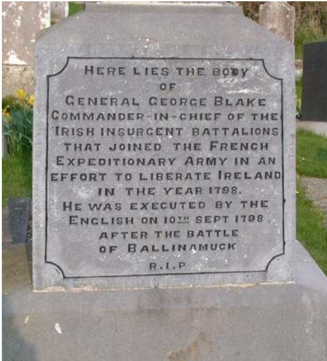
Inscription on General Blake's Memorial